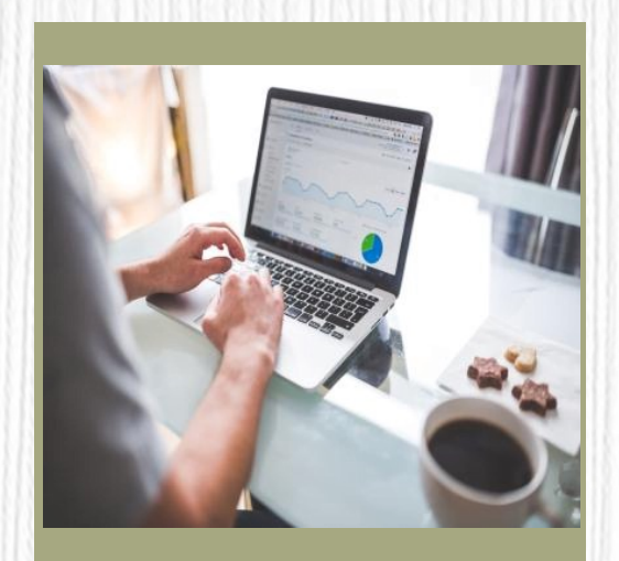
Educating ourselves and others of the FA's work