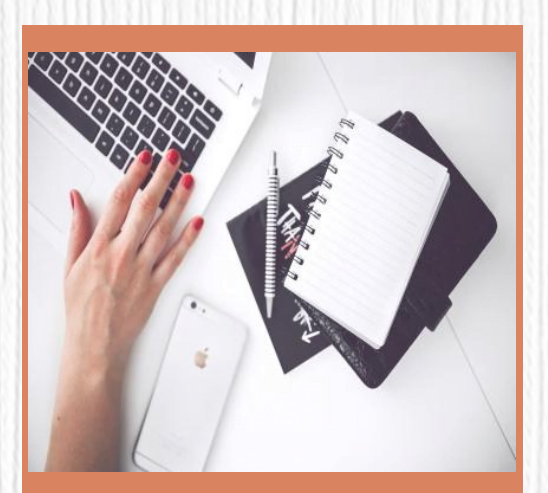
Political Action, Membership, Social Events